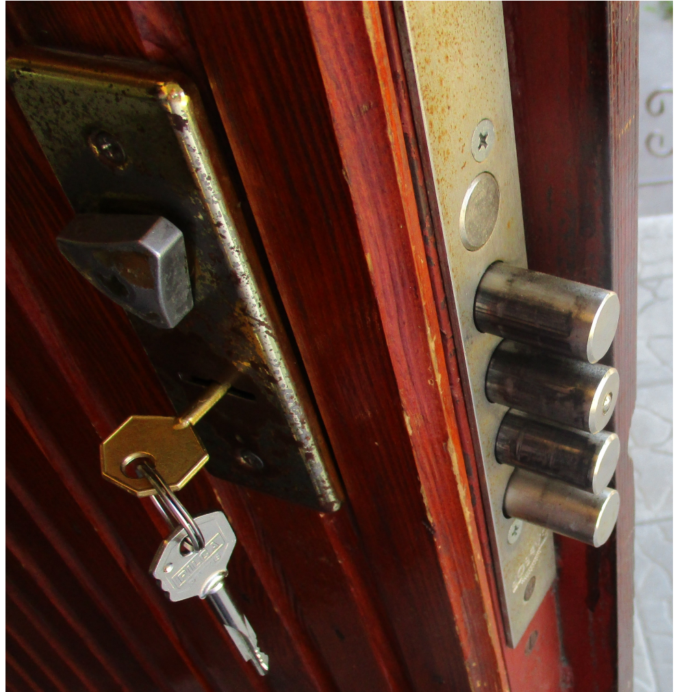
Dead bolt lock on the front door. It takes four full turns of the key to lock or unlock.