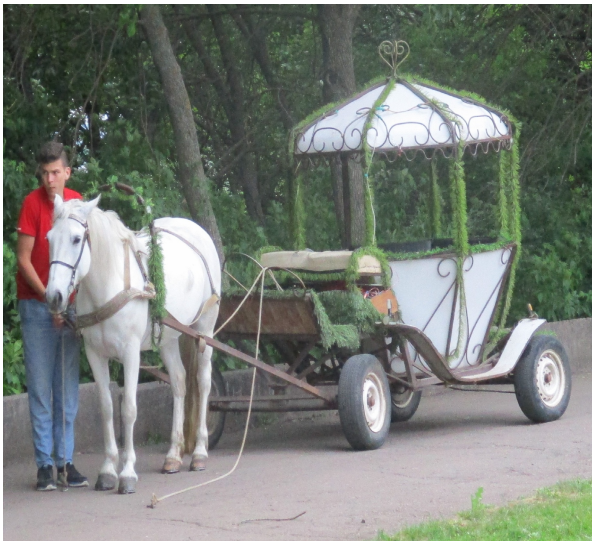
Carriage ride in the park

We returned to the building at about 8:00 p.m. and started studying for tomorrow. We spoke a little about expectation and finally turned out the lights at about 10:00 p.m.